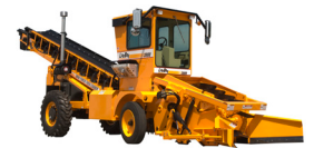
3000 Force Feed Loader