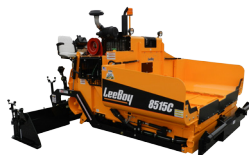
8515C Asphalt Paver