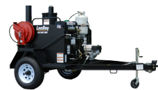
250 Asphalt Distributor